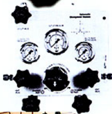
High-Purity, Automatic Changeover Panels