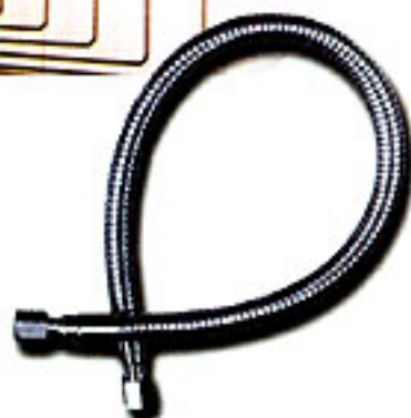
Flexible Metal Hose