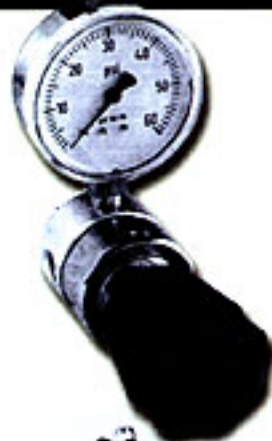
High-Purity Line Regulators